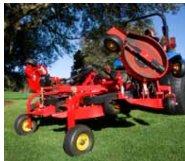
Raises up to 3' in front and 9" in back for transport and easy cleaning