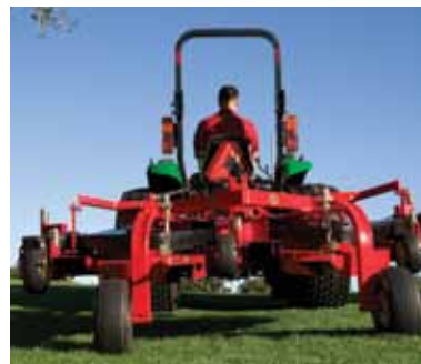
Decks raise for easy transport