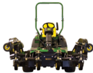
Raises and folds to 78" (198.12 cm)

317.892.4444 1.800.515.6798 Fax: 317.892.4188